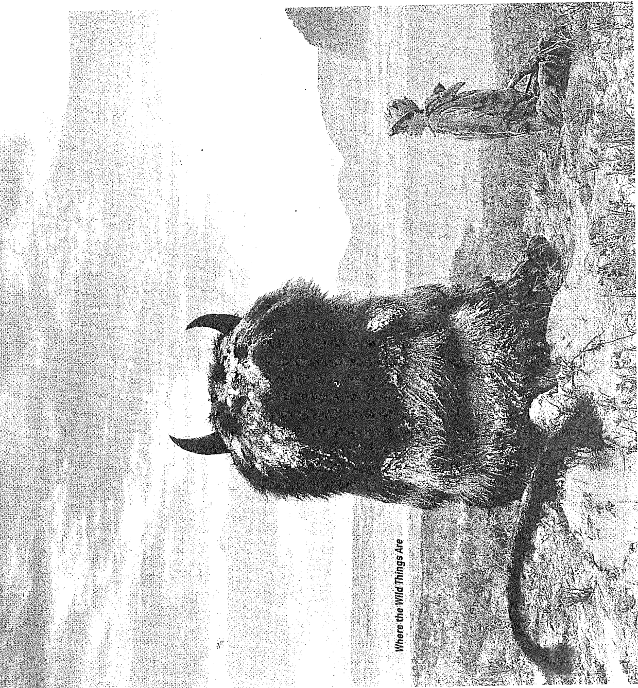
Where the Wild Things Are